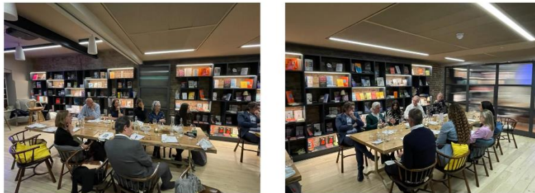
Supporting Action on Climate Change Discussion & Dinner 31 March 2022

Covering the themes of biodiversity loss, climate-friendly investing and shifting public opinion, the event convened a group of 20 guests. Read Alliance magazine's coverage of this event here.