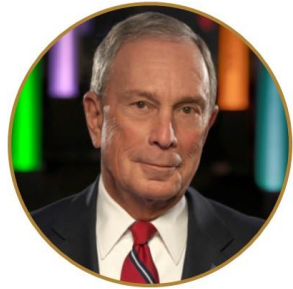
Michael R. Bloomberg Founder Bloomberg LP and Bloomberg Philanthropies