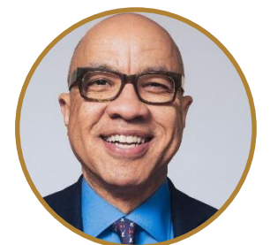
Darren Walker President Ford Foundation