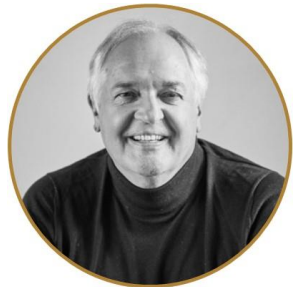
Paul Polman Business leader and author