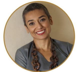
Zainab Salbi Humanitarian, author, and media commentator